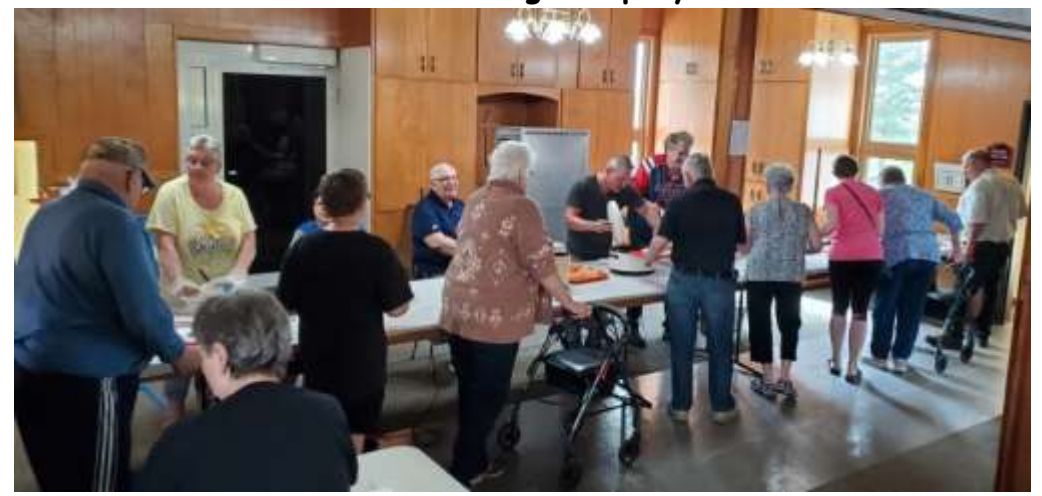
Now for the FOOD!!!