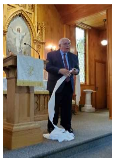
The children's message