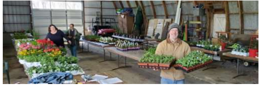
Flower Sale Pickup at the Swift's