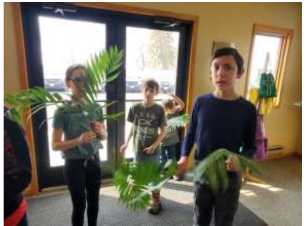
Last Sunday of Sunday School: