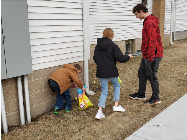
Hunting for goodies for Easter!