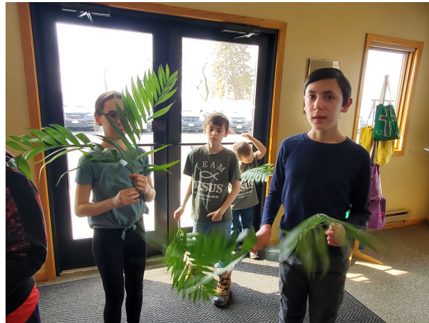
Palms being waved in the beginning of church service

The Sunday School celebrated Palm Sunday by hearing the Easter story while making Resurrection Biscuits. While they were baking we had an Easter egg hunt put on by the Youth group and created a cross by folding paper. When we came back in we discovered that there was nothing left inside the biscuits, just like Jesus was not in the tomb. He had risen! The Sunday School enjoyed marching with Palm branches and singing during the church service, as well.