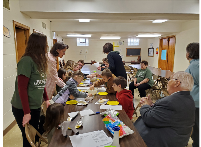
Eating foods in remembrance of Jesus