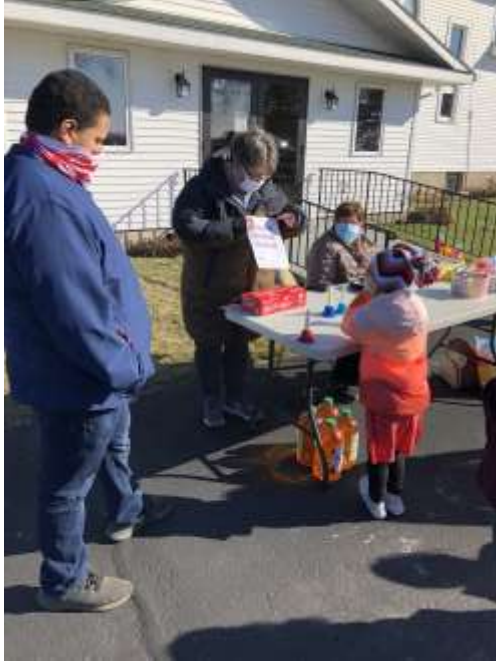
Are we going to ring the “Bells”?