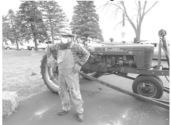
Mr. Scarecrow & his tractor.