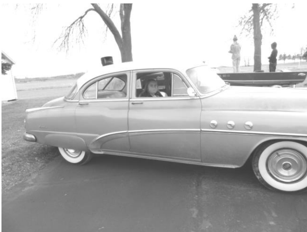
The good old days!