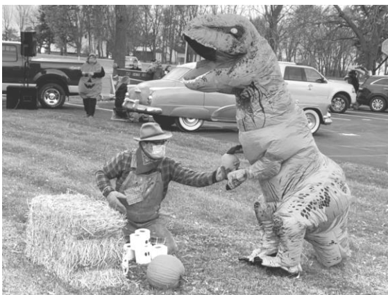
Scarecrow handing out treats!