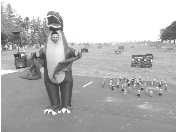
Who could this be?