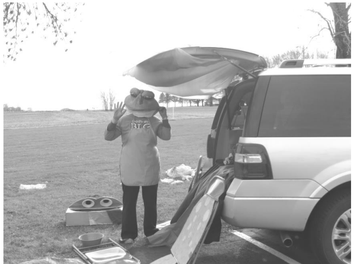
Guess who's the Frog???