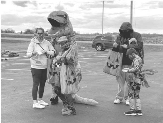
Fun for all!