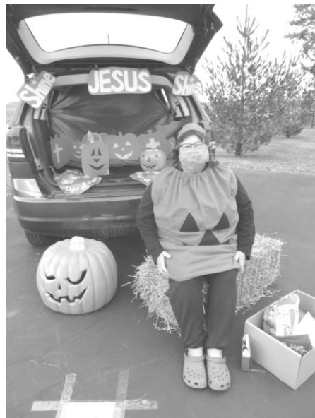
One of our faithful leaders!