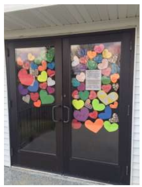
Sunday School packets. Putting up hearts on the church door for others to see.