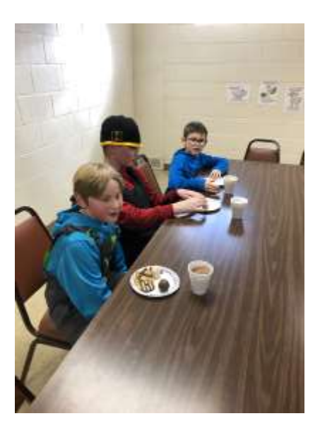
Snack time after a fun time outside!!