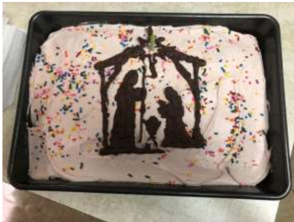
Cake for Baby Jesus birthday

Have you been by the JAM room recently? You'll find enthusiastic, busy young children playing and learning. We love puzzles, trucks, tractors, cooking in our play kitchen, building with blocks, stickers, painting, pasting and coloring. More importantly we are learning about God. We began the year with the beginning of the BIBLE...creation. We have traveled through the Old Testament learning about Noah, Abraham, Joseph, Moses, Esther, David, and Daniel. These people are teaching us that God is powerful, loves us and is always with us. Now we are learning from the New Testament... Jesus, who He is and all the miraculous things He does. The JAM room is an exciting place to be. Come and visit us!