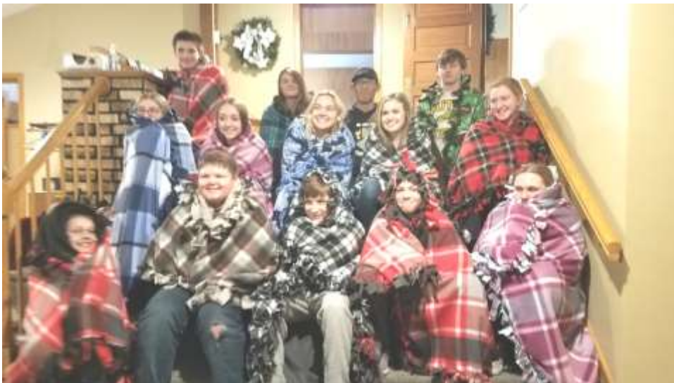
Showing off the finished blankets!!!