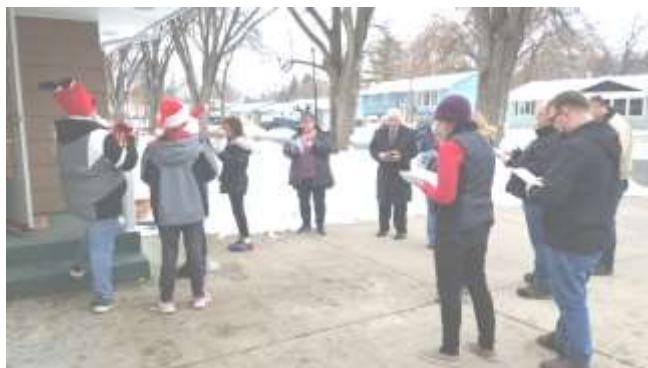
Youth Group and choir caroling and delivering quilts: