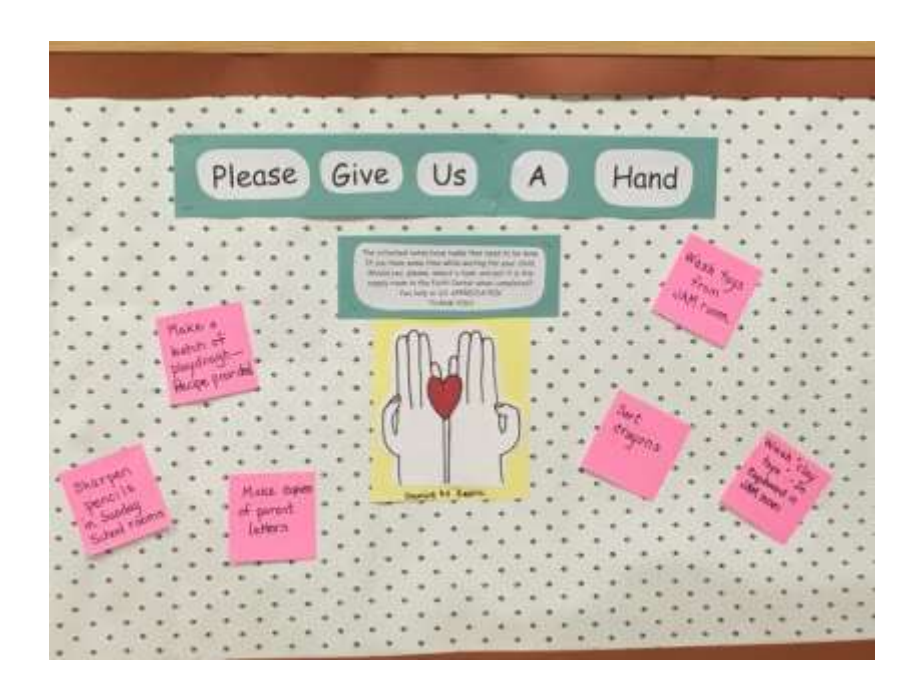
Parents and/or drivers: Coming soon! Help hands needed! If you are dropping off your children on Wednesday evenings, please check out the bulletin board in the entryway. There are post-it notes with a variety of tasks written on them. It would be great if you would choose a task or two, complete the job and put the finished project in the supply room in the Faith Center. Anything you could do would be appreciated. Thank you! Sunday School and Youth Group Staff