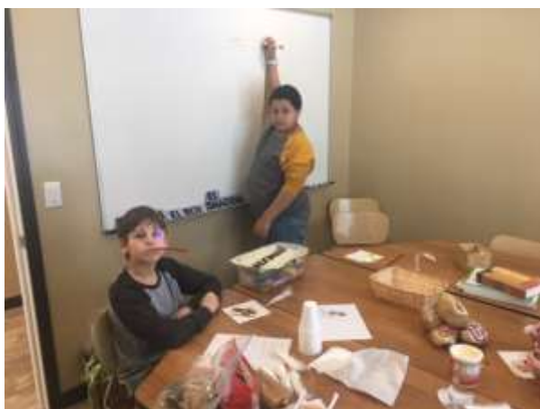
Bible (Basic Information Before Leaving Earth)