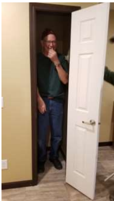
Kids, this "BIG KID" found a "HIDING" Spot!!