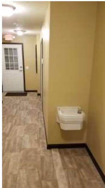
A real working drinking fountain!!

Helen Baker School donated a wonderful asset for our new Sunday School addition, the tables, chairs, white boards, area rugs (and more!) have been put in place and are now in use. We even installed one of the old style water fountains, and it looks and works great!