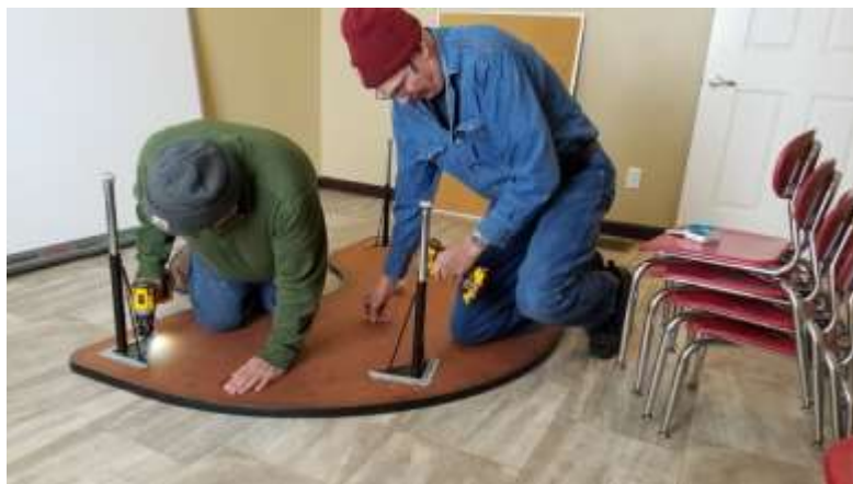
Putting tables together!