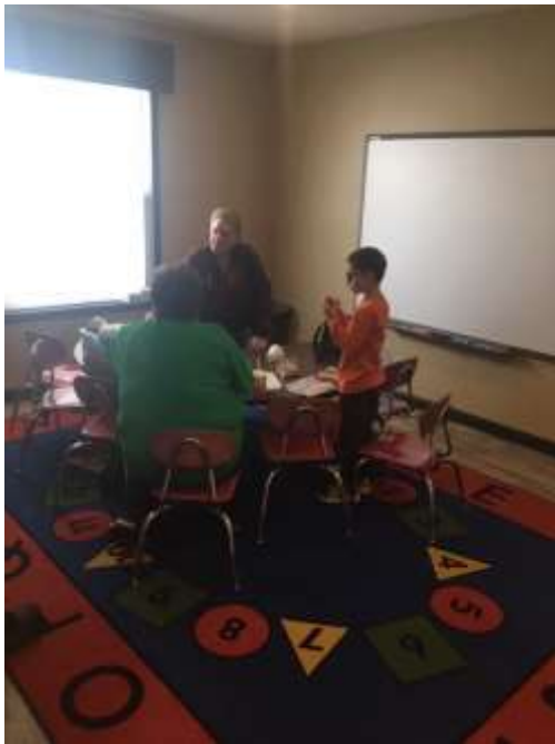
Jam Room (Jesus and Me)