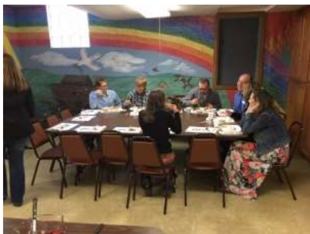
Some of the people enjoying the breakfast