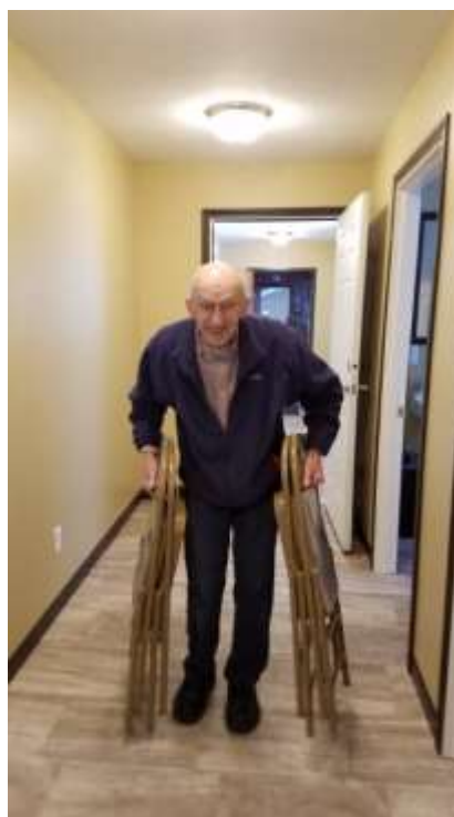
Here come the chairs!