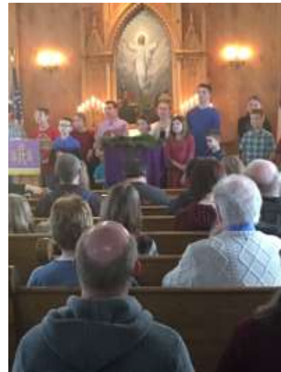
Easter worship service