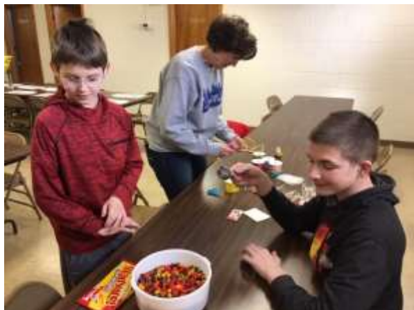
Preparing for the crowd