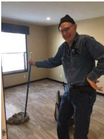
Let's get scrubbing!