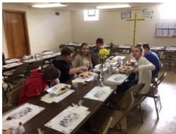
Some of the help are checking it out!