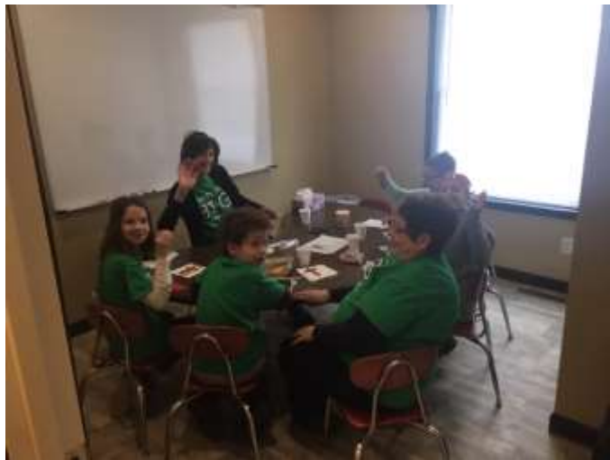
Grace (God Reaches All Children)