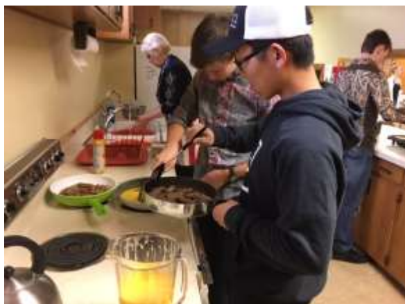
The cooks have started!