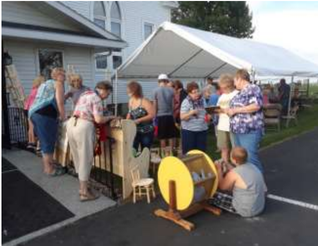
Wrapping up with the raffle drawing!