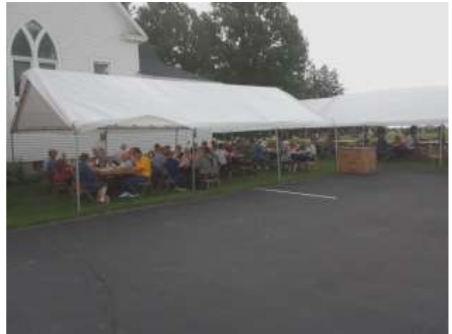
The weather cooperated for the most part, but we were so thankful for the tents!