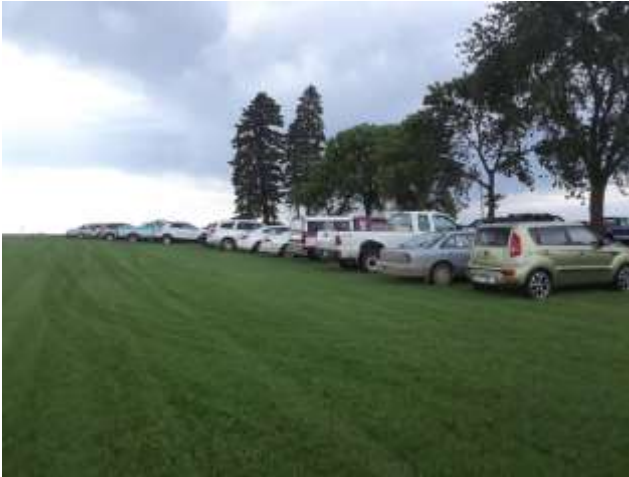
The new grass overflow parking lot worked very well