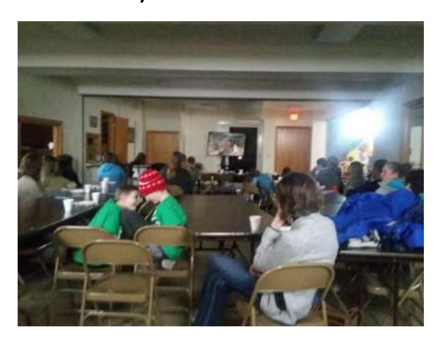
Fun for all!

Last Sunday for Sunday School is May 20<sup>th</sup>!