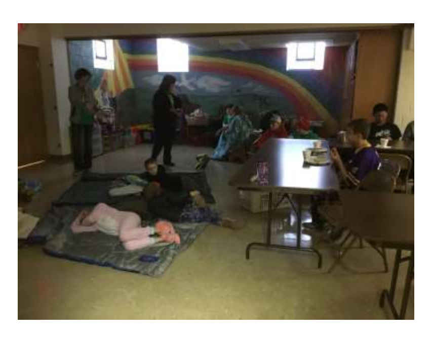
"Muffins & Movie Sunday"