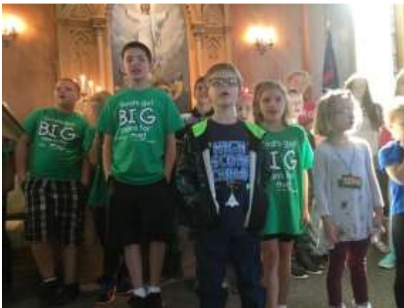
Sing during church service