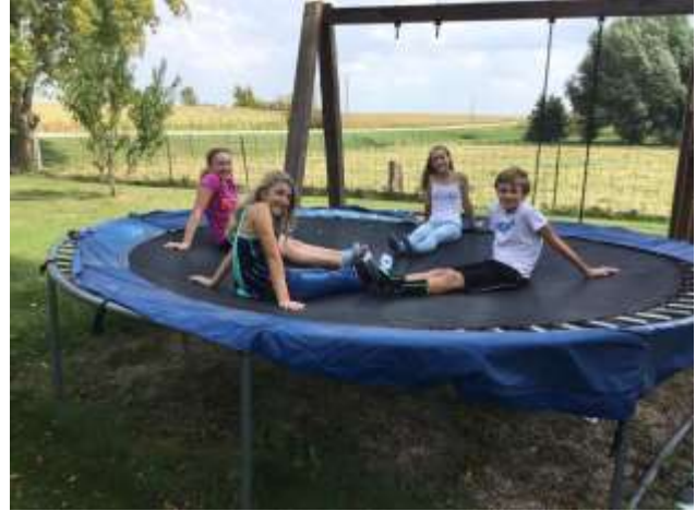
After pictures for Christmas program, some fun at Sladeks!