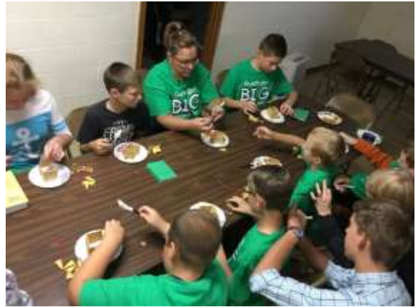
Craft time at Sunday School