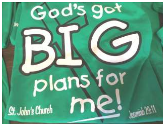
1 st Sunday of Sunday School- each child got a t-shirt!!