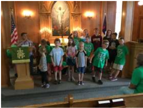
Practice at the end of Sunday School