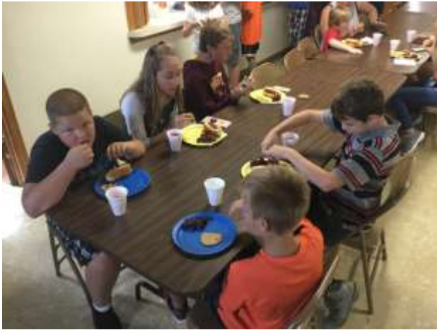
Snack at church before going to Sladeks!