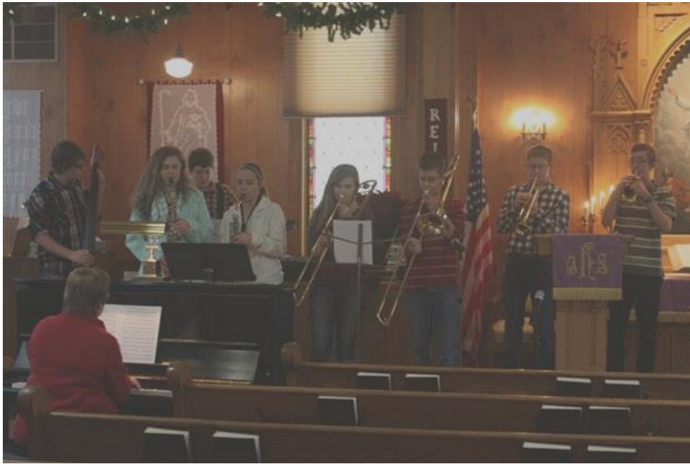
Practicing before service. What a talented group we have!