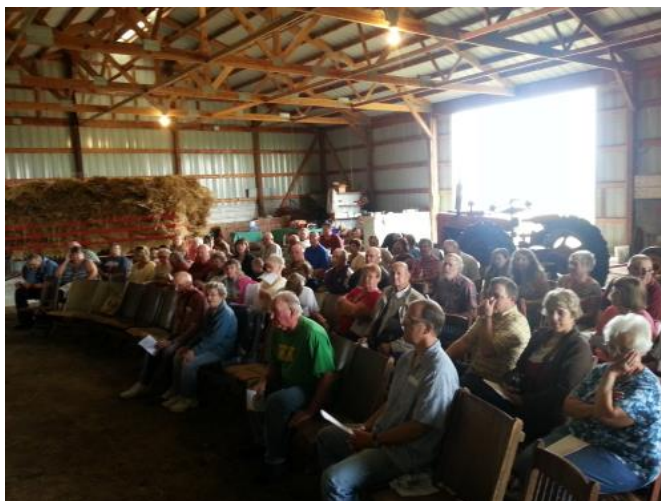
A good crowd attended the service