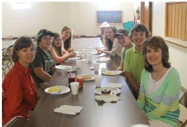
Young Adult Sunday School Class