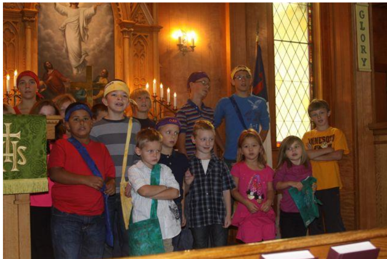
Sept. 19 th singing during worship service