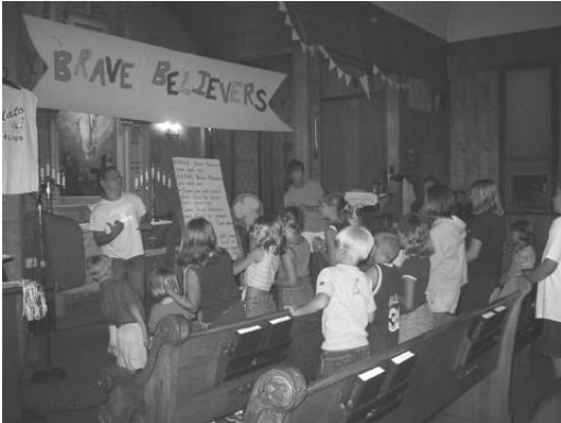
Learning New Songs

We enjoyed another week of Vacation Bible School with about 28 children every night. Our theme was Brave Believers: Extreme Faith Stories. The children heard stories about Samuel, Rahab, Shadrach, Meshach and Abednego, Miriam and Elijah. We sang songs, ate yummy snacks, played games, and made a craft every night. One night we even had a hayride!