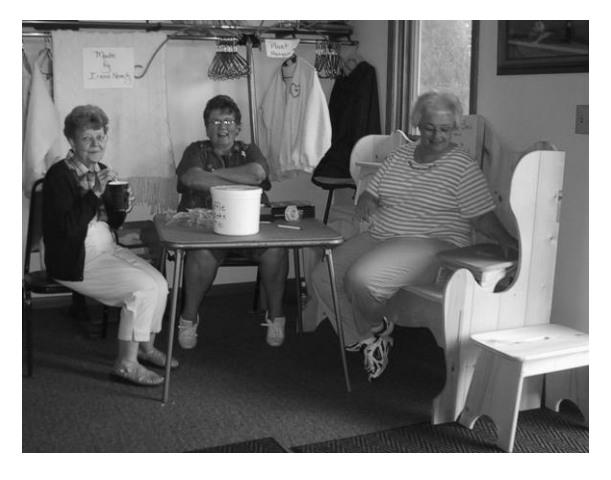
The rain held off, so some chose to eat outside.