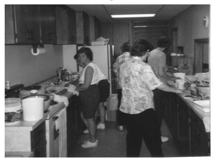
Thanks to Marge Block for submitting some of the Brat Stand and Ice Cream Social pictures.