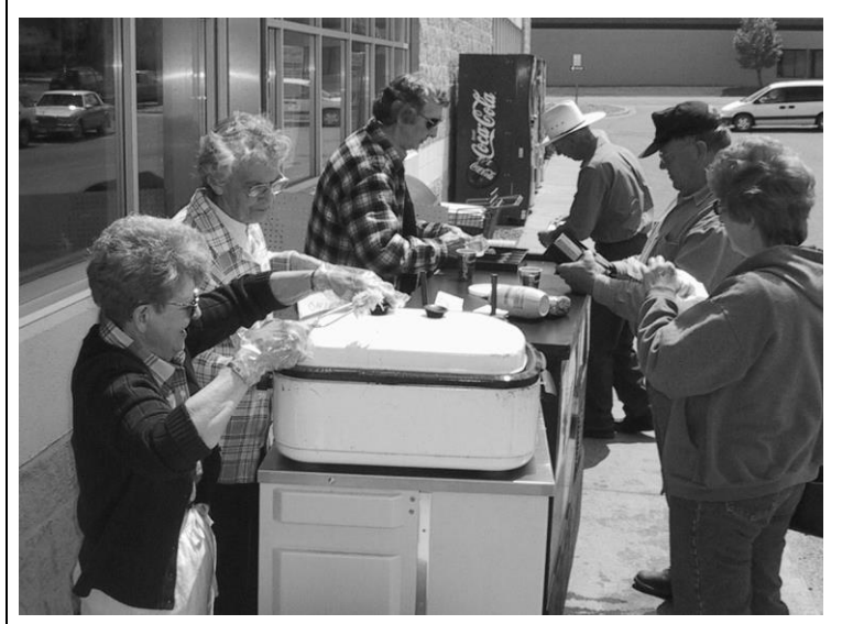
Lots of people turned out to help run the Brat Stand at Econo Foods on May 23, 24 and 25. This event raised $564.14 for St. John's Church! Thanks to all who helped.