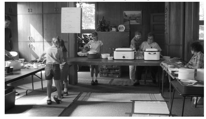
Raffle prize squatters???