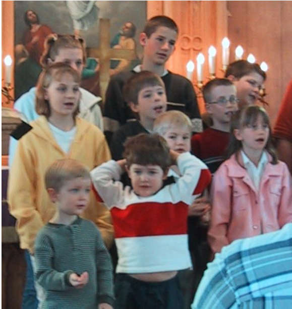
Sunday School Children Sing on Palm Sunday, April 8, 2001