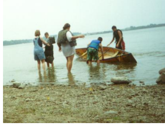
August 24 - 25th:

Six members of the youth group went on a camping